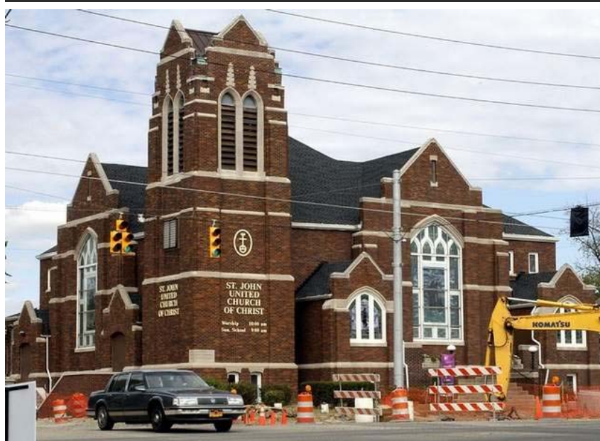
St. John Church of Christ at Washington Street and German Church Road may exemplify Tudor Gothic revival architecture, but it no longer meets the congregation's needs.