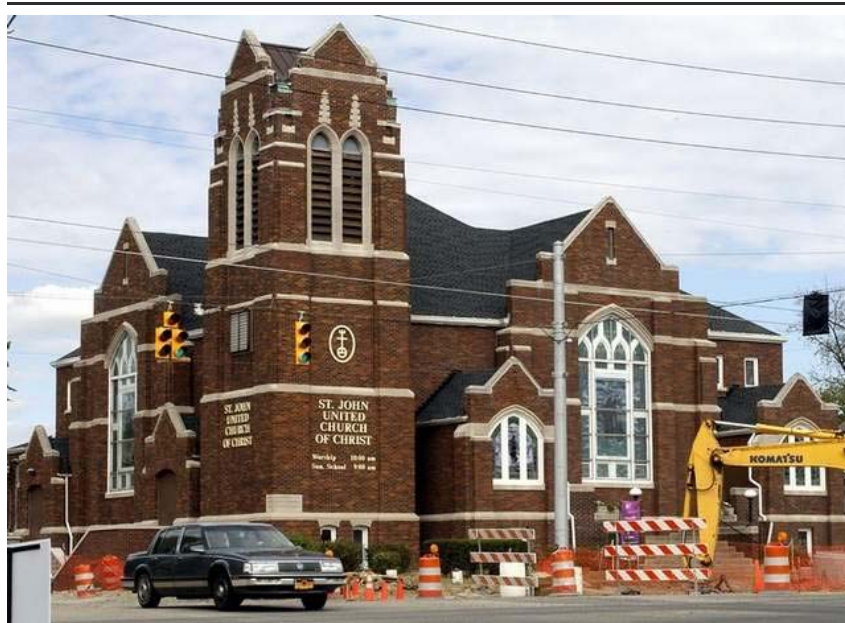
St. John Church of Christ at Washington Street and German Church Road may exemplify Tudor Gothic revival architecture, but it no longer meets the congregation's needs.